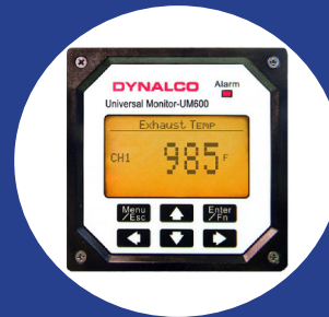
UM-600 6- Channel Universal Monitor