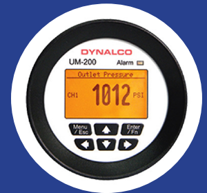
UM-200 2- Channel Universal Monitor