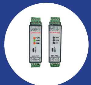
SST-7000 Digital Speed Switch & Transmitter