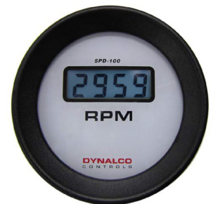
SPD-100 Digital Tachometer